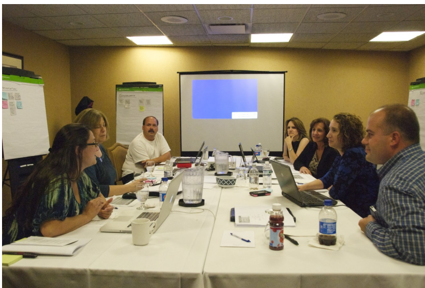
PMI Rochester Board October 3 Workshop

Communications Organization & Governance Membership Professional Development Finance Volunteers Outreach